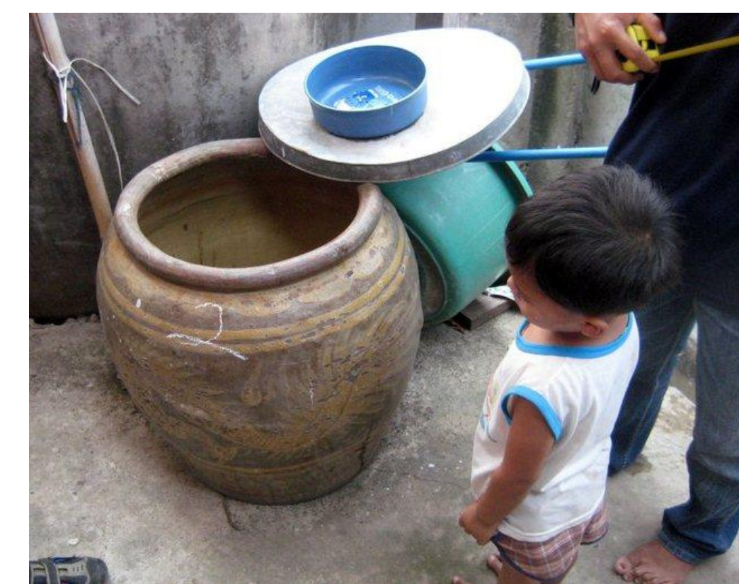
Figure 1. Typical earthen jar used to store rainwater for everyday use.

Other water quality parameters: pH, temperature, total dissolved solids, dissolved oxygen, and turbidity measured in-situ during the dry season at the time of sample collection.